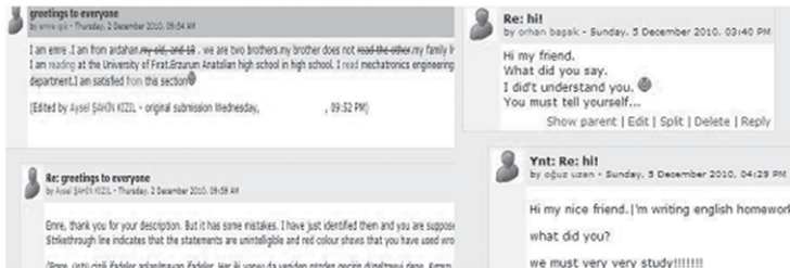
Figure 3. Forum module for writing activities

YouTube videos which could be easily integrated into Moodle made a great source for audio and video files as also suggested by Lin (2011), and special attention was paid to ensure the materials were authentic and related to the theme/topic of the week. Students were provided with constant feedback for all the responses they produced for any activity. Each week ended with a writing activity which was realized through the forum module. In connection with the topic of the target week, students were required to produce a short writing piece and share it on the forum module as shown in Figure 3.